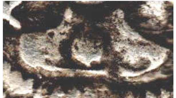
Normal Leaf on breast with flat base line to drapery.