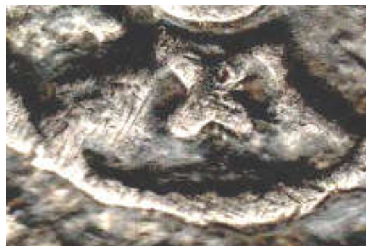
Saltire on breast.

All coins illustrated are in the authors collection.