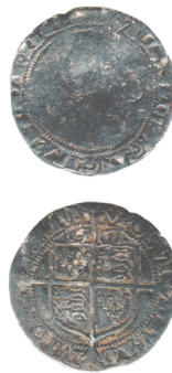
DIG 2ii/D Rn 356 1.31g