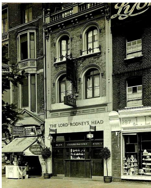
Fig. 2. The Lord Rodney’s Head, Whitechapel Road, London, post 1899.

Notes. Robert Elliott Victualler [1844-1860]. Pub at 138 Whitechapel road before 1806. Music Hall “Prince’s Hall of Varieties” existed 1854-1885. The road was renumbered before 1910 and the Lord Rodney’s Head was then at 285. It was renamed the Funky Munkie in 2000. Finally closing in 2004 to become a shoe shop and is now a clothes shop. In Figure 2, The J. Lyons shop next door confirms that this photo was taken after 1899.