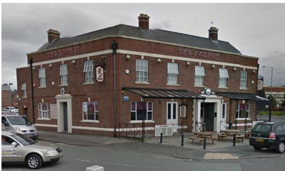
Fig. 3. The Rodney, Warrington, c. 2019.