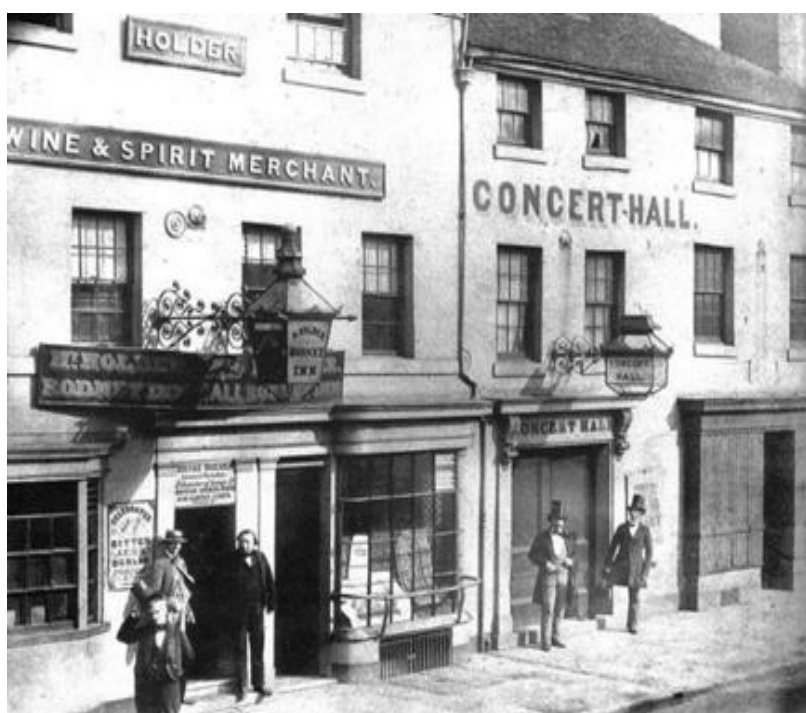
Fig. 1. The Rodney Inn and Concert Hall, Birmingham, before 1857.