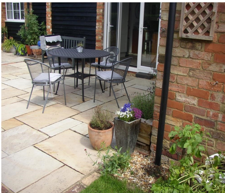
Fig. 1. Patío laid over find spot.

There are two possible candidates for William Hebbs in Woburn at this time. The family tree of the first is easy to find as shown below.