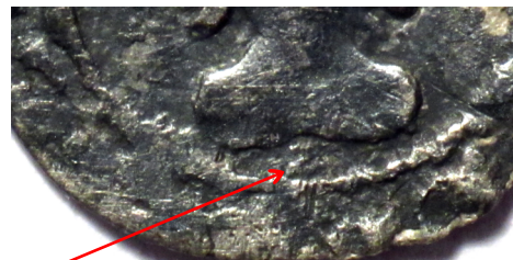
Pellet below bust

Thus we have a new variety of Richard III halfpenny with initial mark sun-and-rose and pellet below bust corresponding to the types found for the groat and halfgroat.