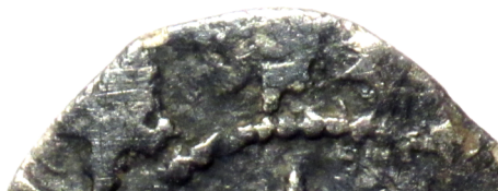
Initial mark sun-and-rose