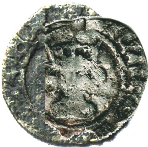
Composite images of the halfpennies overlaid on each other to give an overall view of the pellet below bust type.