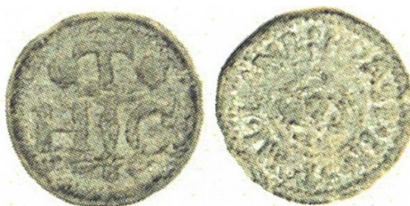
Fig. 2. Original lead token made from the mould. (200%).