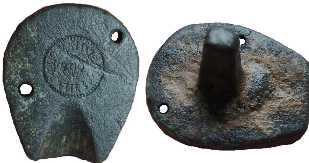
Fig. 1. Token mould. (approximately 200%, scaled from token below).

The copper and brass tokens issued between 1648 and 1672 are well known and several of the original dies used to make them have survived. There is also a smaller, parallel series of cast lead tokens that started several decades earlier and finished about the same time with the introduction of a regal copper coinage in 1672. The mould shown below was recently found whilst searching the Thames foreshore.