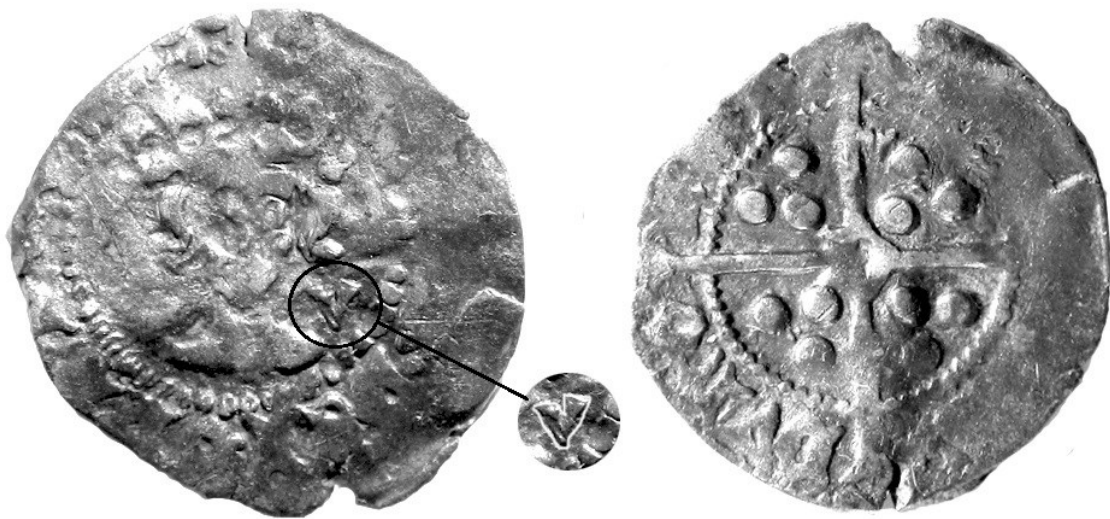
Figure 5. Edward IV Durham halfpenny. (No.6)

Fig. 5 shows an example of the Durham halfpenny with the 'V' to the right of the neck. This also occurs on some of the rarer varieties of the penny.