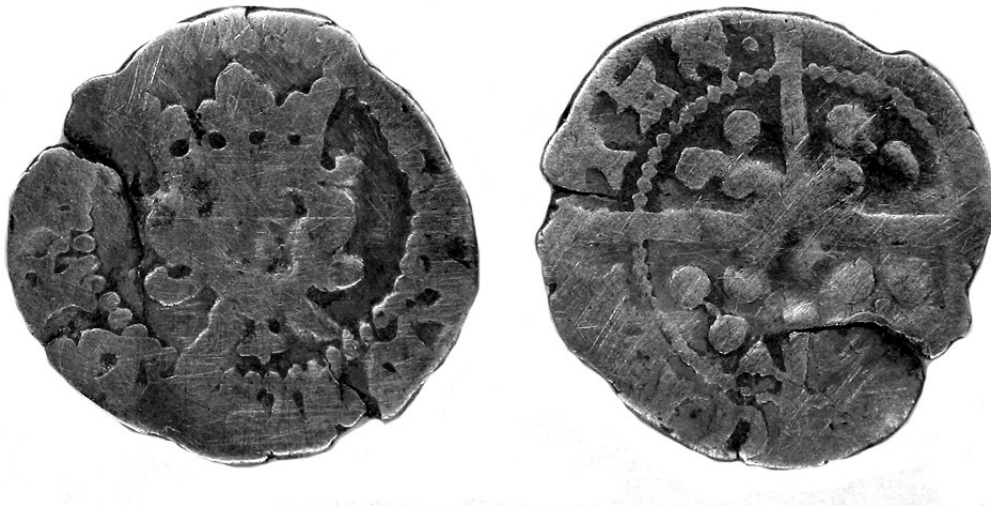
Figure 1. Edward IV Durham halfpenny. (No.1)

The first two halfpennies shown below (Fig.1 and Fig.2) could possibly be related to the Durham penny with a cross on the breast and crosses over the crown, Spink number S2117 (Spink, 2021). These halfpennies do not appear to have crosses over the crown which could be simply due to lack of space?