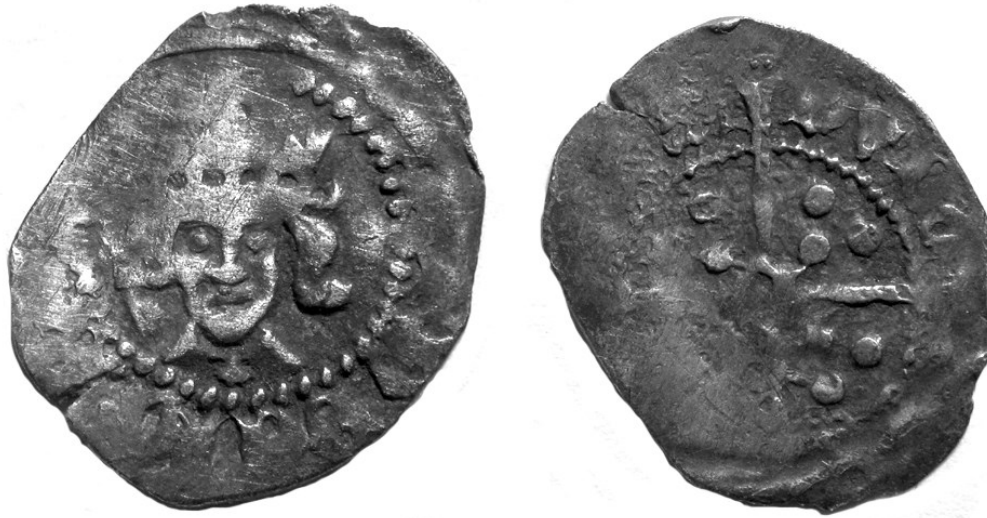
Figure 2. Edward IV Durham halfpenny (No. 2).

Notes: Cross on breast. Four extra pellets on reverse and 'V' in CIVI quarter. Two examples known to author. The example in the British Museum and has a large 'D' in centre of reverse cross. It is not clear whether the above coin has a 'D' in the centre of the reverse.