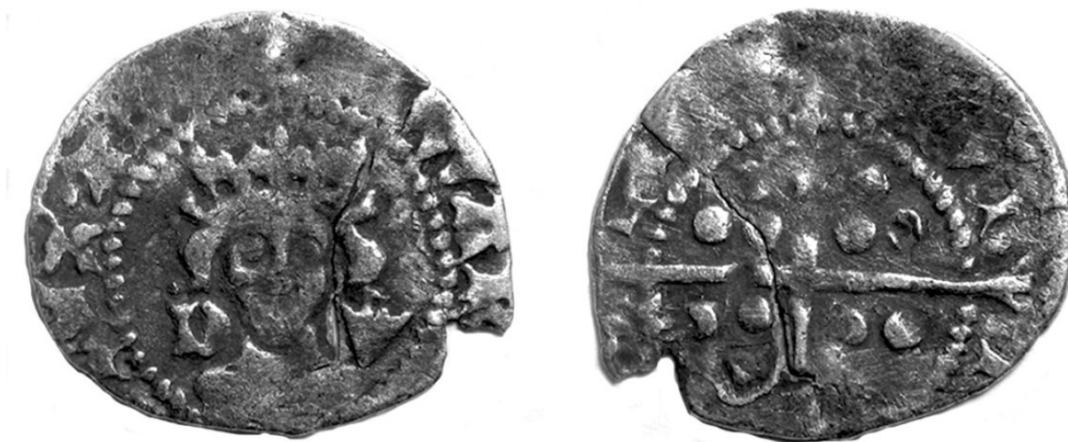
Figure 6 Edward IV Durham Halfpenny. (No.7)

Obverse: [?] [ED]WAR[D][DI or DEI GRA]REX An[G?]