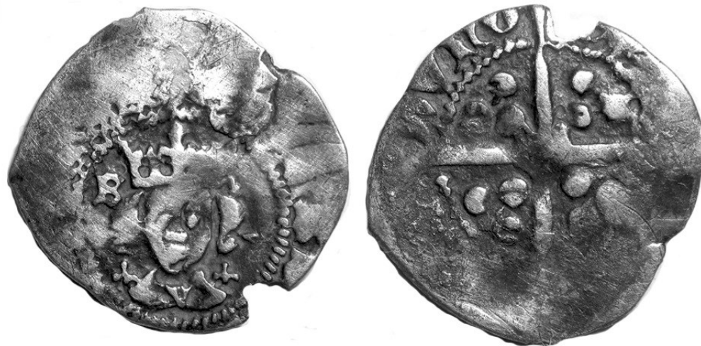
Figure 3. Edward IV Durham halfpenny. (No.4).

between these coins is the reverse legend. This reverse legend appears to read DVNOLMI or possibly DVNOLMIE.