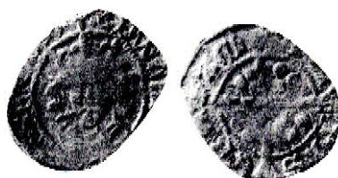
B&W XII5 pl 3 24 IM Short Cross Fitchee, no quatrefoil on reverse