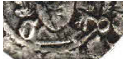
Edward IV light coins - key with thin lines representing the 'bit'