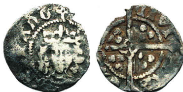
T. Cook 0.72g IM Restoration Cross.