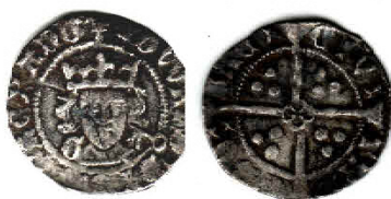
DIG rn2306 0.79g IM large lis, B&W VII 1