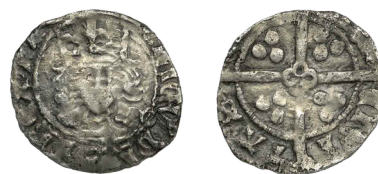
Dnw 2018 Nov 714 0.60g IM Large Lis B&W XI3 reads HERICV