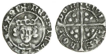
Spink Auction 16022_1408_1 0.76g IM Restoration Cross. B&W XI2