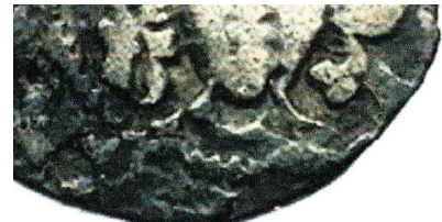
Henry VI restored - key with thicker shaped lines representing the 'bit'