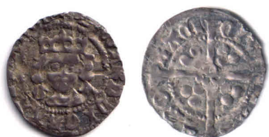
Fitzwilliam Museum Ex C.E. Blunt IM Short Cross Fitchee, B&W XII4