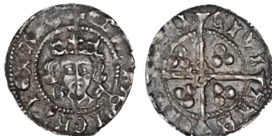
Spink Auction 12009_863_1 0.84g IM LCF B&W X2