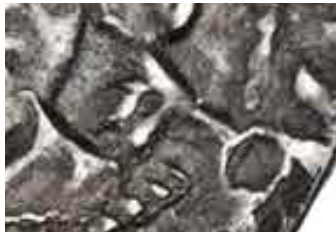
Edward IV Key