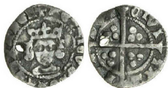
Spink Auction 16022_1409_1 0.62g IM Restoration Cross B&W XI1