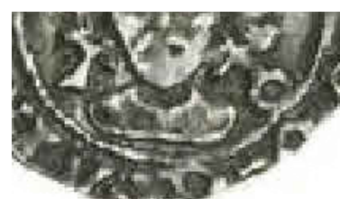
Edward IV second reign coins - key with, once again, thin lines representing the 'bit' For Archbishops Neville, Booth and Rotherham.