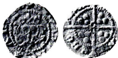
BW pl3 16 B&W Local 4