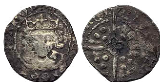
T. Cook 0.72g IM Large Lis B&W XI2 Reads HENRICV