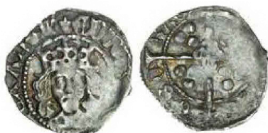
Spink Auction 16022_1442_1 0.61g IM Small lis, B&W XI1 pl 3 22