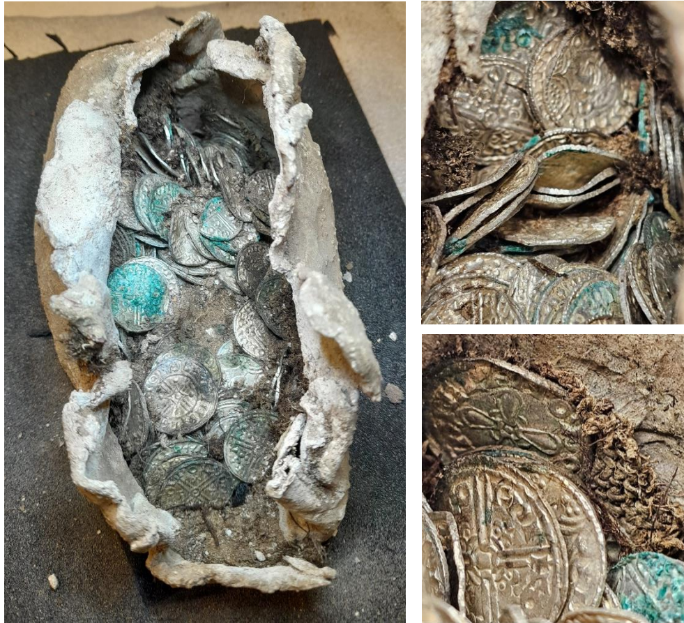
Figure 2: Left – the hoard after initial opening and removal of soil. Top right: detail shot of coins during micro-excitation. Bottom right: detail shot of coins and associated textile during micro-excitation.

The package was found to contain a large quantity of silver coins ( Figure 2 ), which had been wrapped in a piece of textile and then enclosed in a single piece of lead sheet. The lead itself did not appear to be cut from a larger, formal object, showing evidence of being slit at both ends to facilitate tight folding. Though the textile was significantly degraded, much survived – including some fragments to which coins were corroded. Initial analysis suggests that this may originally have been a relatively coarse piece of simple, folded cloth rather than a purse or drawstring bag. However, this identification is preliminary.